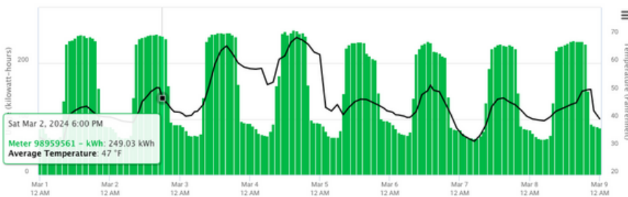
Sample energy signature for cannabis cultivation.